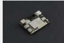
LattePanda 2GB/32GB - A Powerf.....