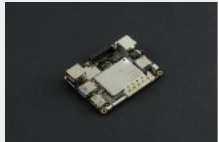
LattePanda - A Powerful Window.....